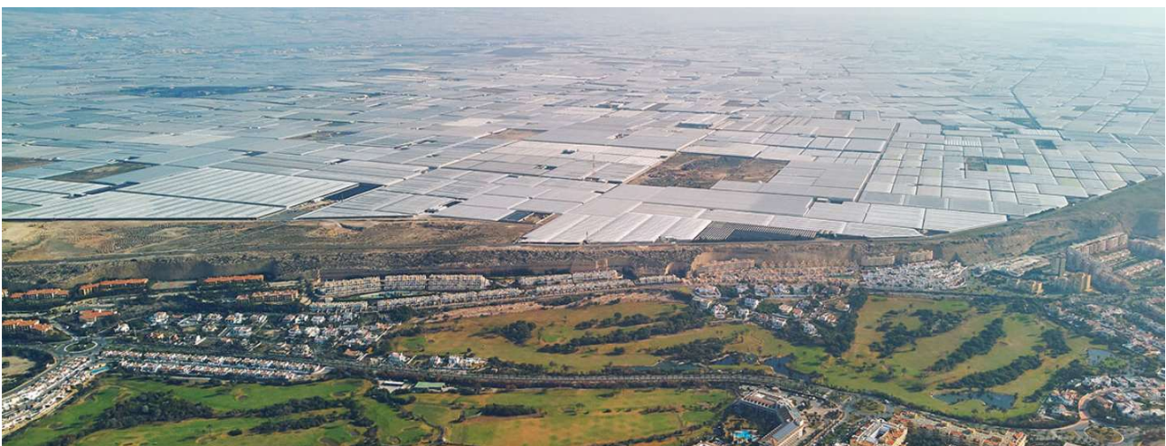
View of intensive agriculture and greenhouse cultivation in Almeria

The schedule of IFAMA 2024 included 4 intensive working days (between the Academic Symposium and Business Forum), plus one dedicated to the technical visit to companies in the territory. During the first day of the conference, dedicated to the dissemination of research works and so to the academic community, different research works were presented such as papers, extended abstracts and posters. Specifically, during the first day of the conference, at the same time of the other research sessions, a session called “Blockchain Technology and Innovation” was held, coordinated by Prof.ssa Marian Antonietta Fiore (University of Foggia) and entirely dedicated to the application of this technology and the innovation and implications that it creates in the agrifood sector.